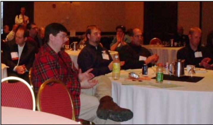
Attendees at the Winter Conference.

Thank you to our sponsors Chartwell Capital Solutions, Enterprise Services, and ESOP Insourcing.