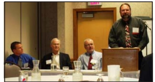
Panelists at the April Conference.

At the close of the day, our chapter held a raffle for the Employee Ownership Foundation, where $211 was raised.